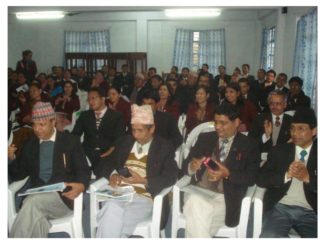
Teachers of GBS school