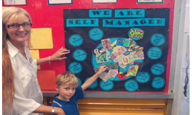
sang me a song about the needs)

At the invitation of the acting Principal, I spent a day in the school to co verify the reaccreditation process. This day highlighted several aspects. Individually two parents from both ends of the socio-economic background shared with me. I met with students who shared with me their perceptions of their classroom. I met with a teacher who had been through a year with some challenging students and I visited a Prep Class where the 5 year olds