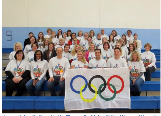
Aspen School's Faculty/Staff proudly kick-off the Glasser Olympics!

On February 8, the 7th annual Family University was held featuring WGI-US faculty and trained Aspen parents and teachers who presented Choice Theory psychology ideas to prospective and currently enrolled parents and children ages 4