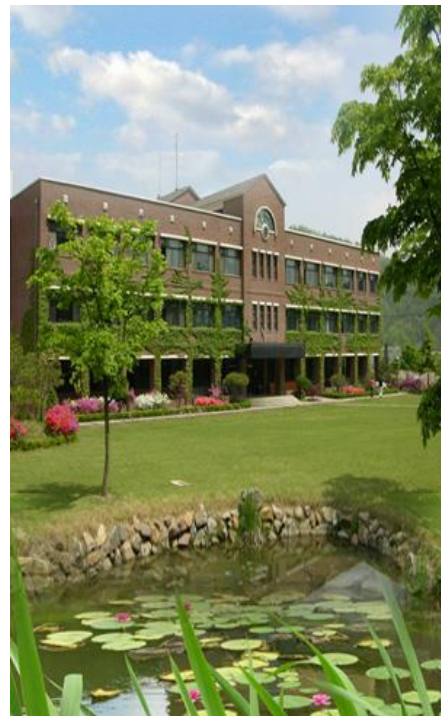
Yangebo High School in Korea www.yangeob.hs.kr

Congratulations to Sunshine School in Australia and St. Patrick's Catholic Academy for going through state re-accreditations and passing with flying colors!