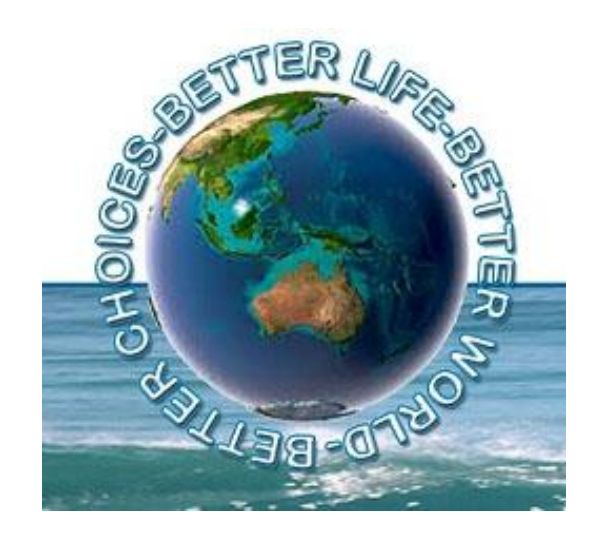
The William Glasser Institute Australia 1 – 3 October 2015