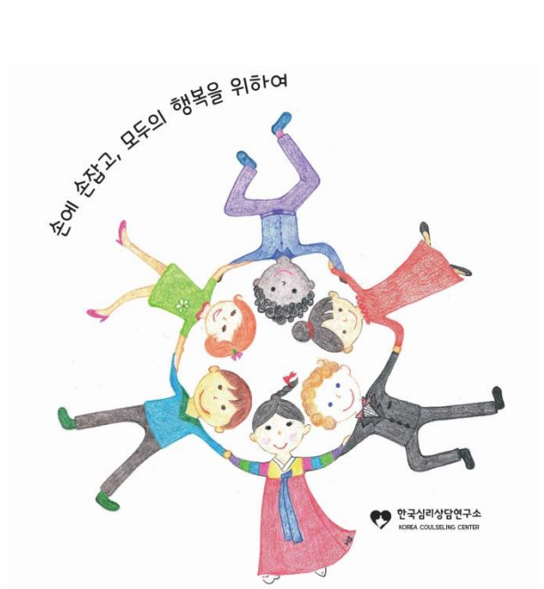
2016 R.T. International Conference in Korea 7-9 July, 2016